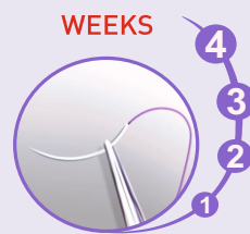
Knot pull tensile strength (KgF)